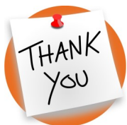
Notes of Thanks